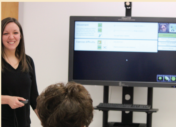
The right blend of technology and specialized therapists to help get you to where you want to be.

No matter what difficulties you are having from an accident, surgery, chronic medical conditions, or new onset health condition, Crouse Community Center is here to help.